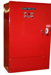
Fire Pump Transfer Switch