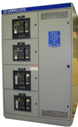
UL 891 Switchboard