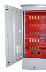
Quick Connect Cabinet