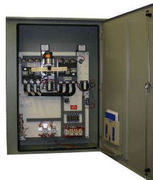
Florida Power and Light ATS (Electro Mechanical)